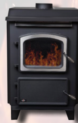
MODEL 608 STOKER