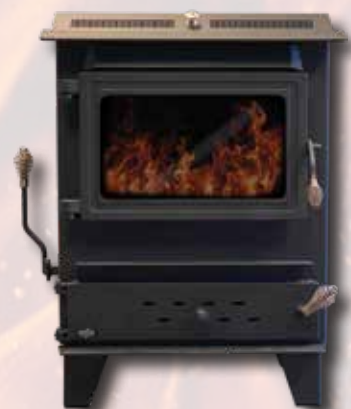
E-Z FLO MODEL 30-95