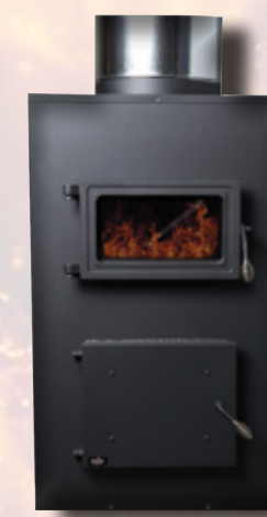
MODEL 710 STOKER