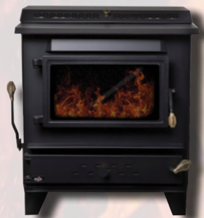
E-Z FLO MODEL 50-93